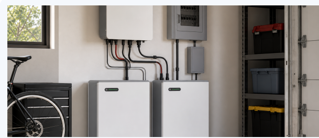
Neutral home battery reference scene for distributor compatibility discussion.